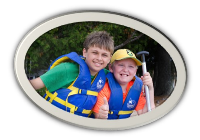
JULY 31 - AUGUST 5, 2016 - APSEA/ELKS DEAF CAMP a camp for students who are deaf or hard of hearing. Registration is now OPEN. APSEA will be holding a Leadership in Training program again this year (July 29-30, 2016) for students aged 16-18. Go to the APSEA Website (www.apsea.ca) and click on the Deaf Camp Logo to register. Deadline for registrations is April 1.