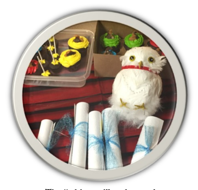
The "white owl" and cupcakes.