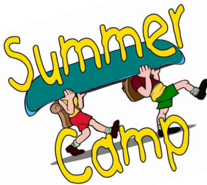
Camp See-Ya Brigadoon Village